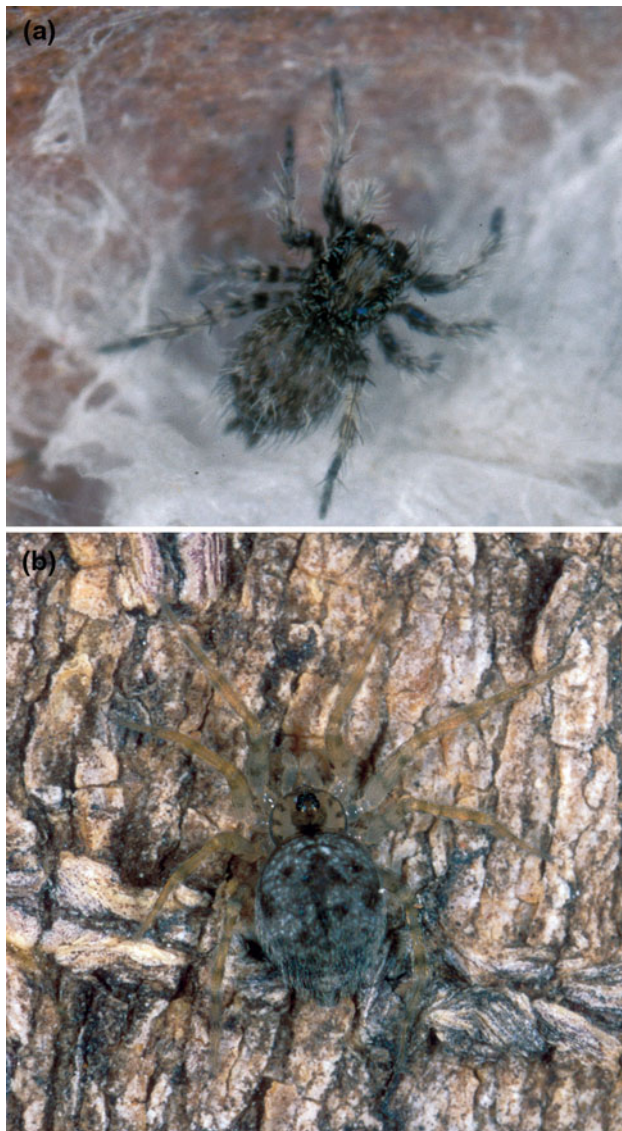
Fig. 1 Spiders used for testing. a Portia africana juvenile (body length 2.5 mm). b Oecobius amboseli adult (body length 2.5 mm)

Portia juvenile during an encounter with an oecobiid can also be characterised as aggressive mimicry because, upon finding O. amboseli in a nest, it first settles nearby and then, having remained quiescent for a highly variable interval, begins probing intermittently on nest silk with its palps and intermittently striking the nest with its forelegs. The oecobiid eventually responds by leaving the nest. Portia exploits the oecobiid's predisposition to respond in this way either by making a predatory attack when the oecobiid comes out of the nest or, if that fails, by waiting and ambushing the returning oecobiid (Jackson et al. 2008).